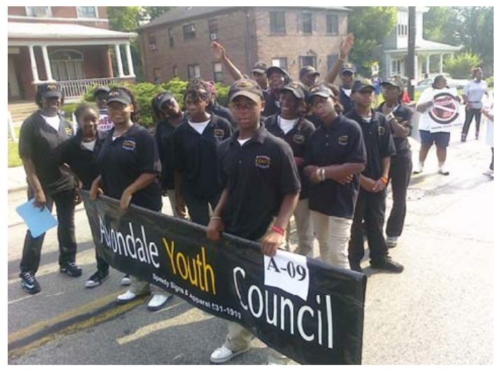
AYC in Black Family Reunion Parade