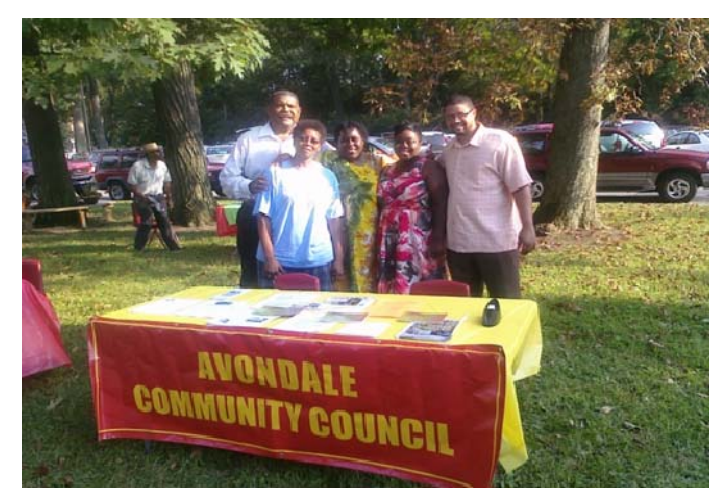
ACC at Phoenix Academy Parent Orientation Night